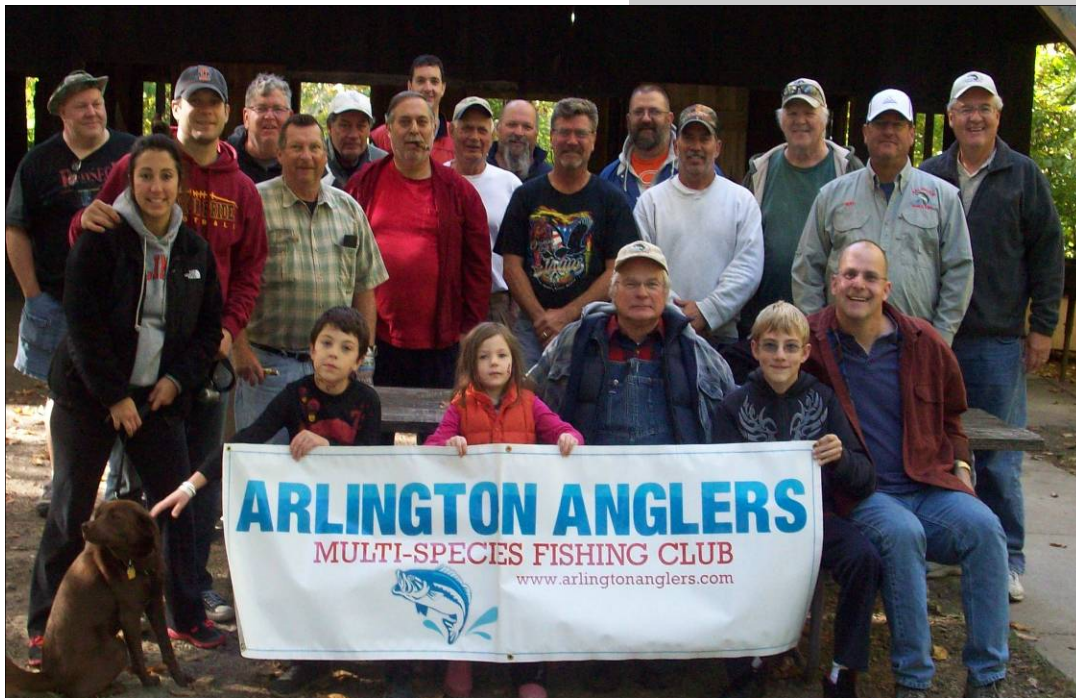
The weather and fishing was great for the 30 members and families for the October fishing/camping trip to Lake Clinton.