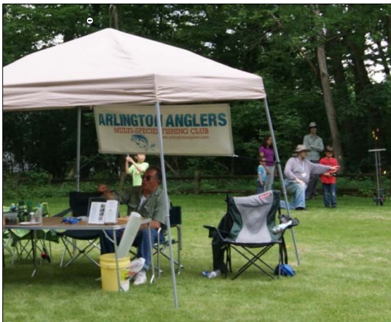
Arlington Anglers Team up with Cabala's to teach casting to kids at the Crabtree Nature Center on 6/9/13.